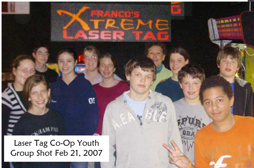
Laser Tag Co-Op Youth Group Shot Feb 21, 2007