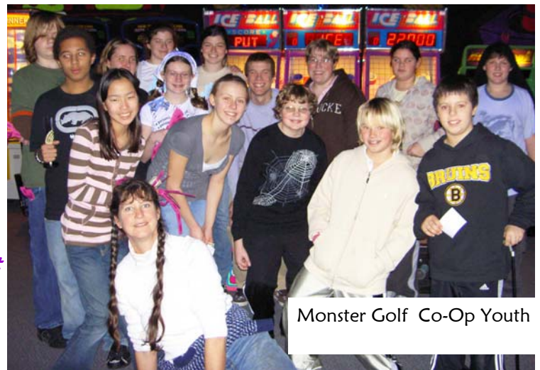
Monster Golf Co-Op Youth