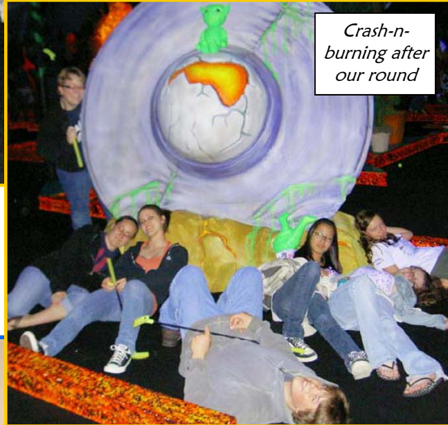
Crash-n-burning after our round