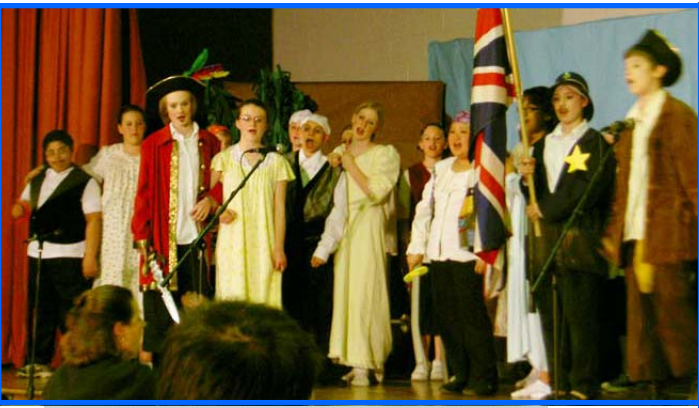
More Penzance per chance!