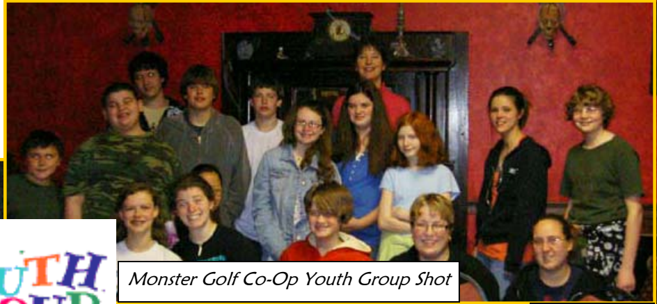
Monster Golf Co-Op Youth Group Shot

Monster Golf - We slipped off for a fun day of Monster Golf during Spring Break (actually it was tax day April 15 but who among the youth knew)!? We had a